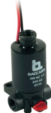
G75-A | 3W | Plastic