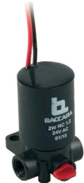
G75-A | 2W | Plastic